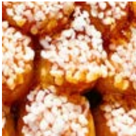
Solid coarse sugar