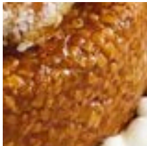
Nougatine For 1' or 1.5'