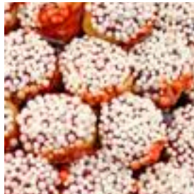
Solid pearl sugar