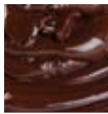
Dark chocolate crèmeux