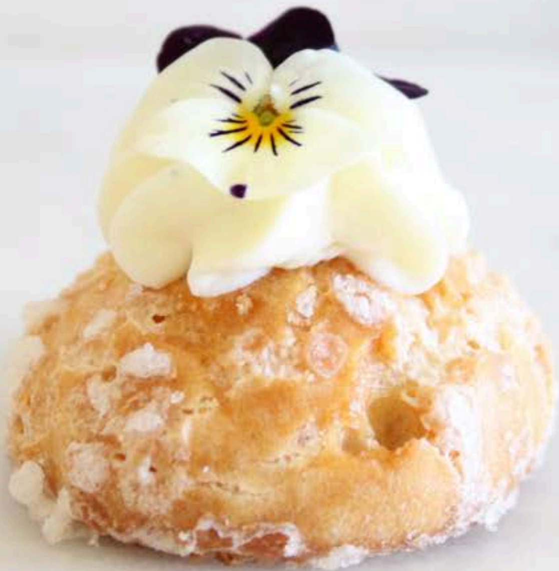
PETIT TROPEZIENNE CHOUX