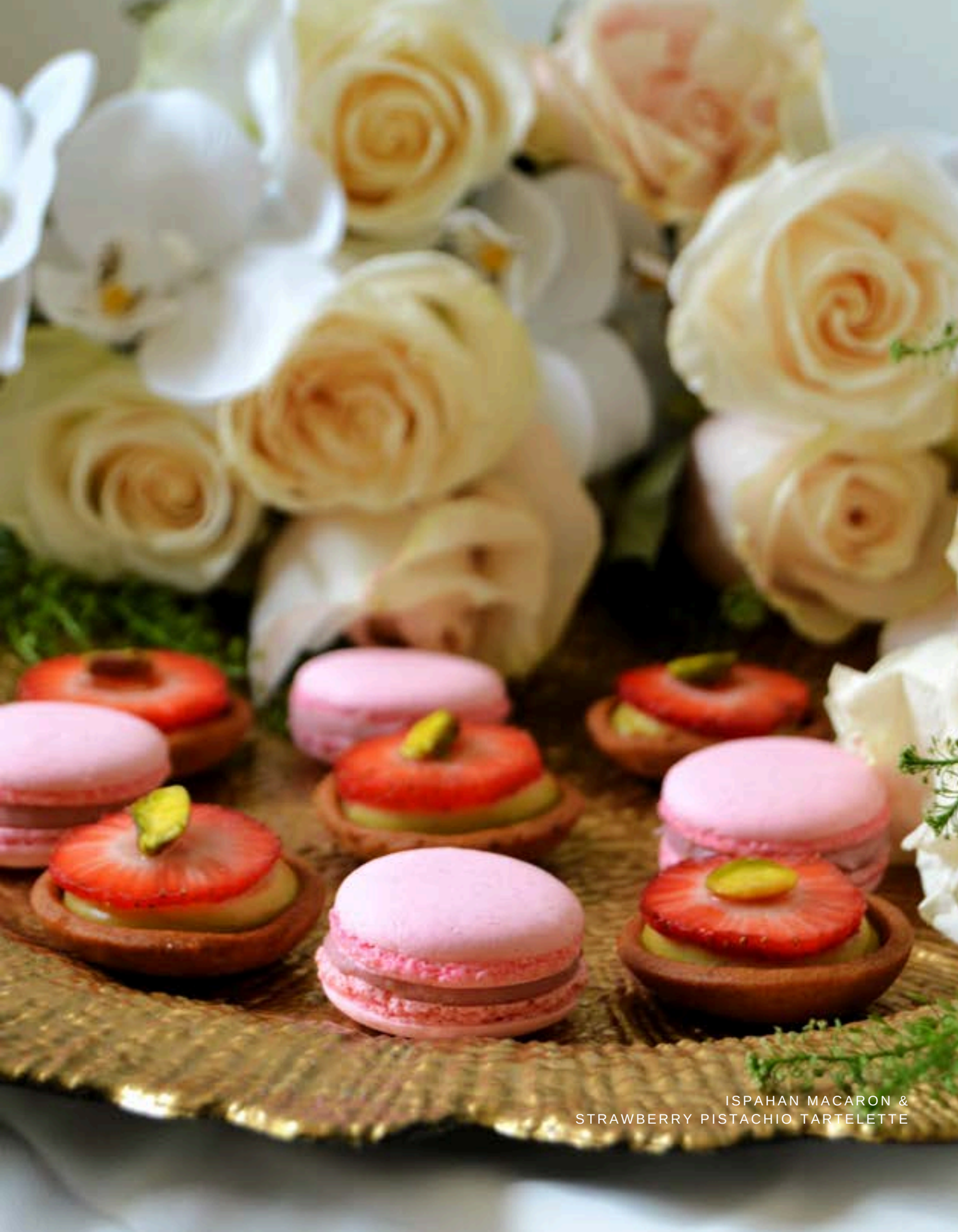
ISPAHAN MACARON & STRAWBERRY PISTACHIO TARTELETTE