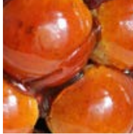
Solid caramel glaze