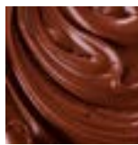
Milk chocolate crèmeux