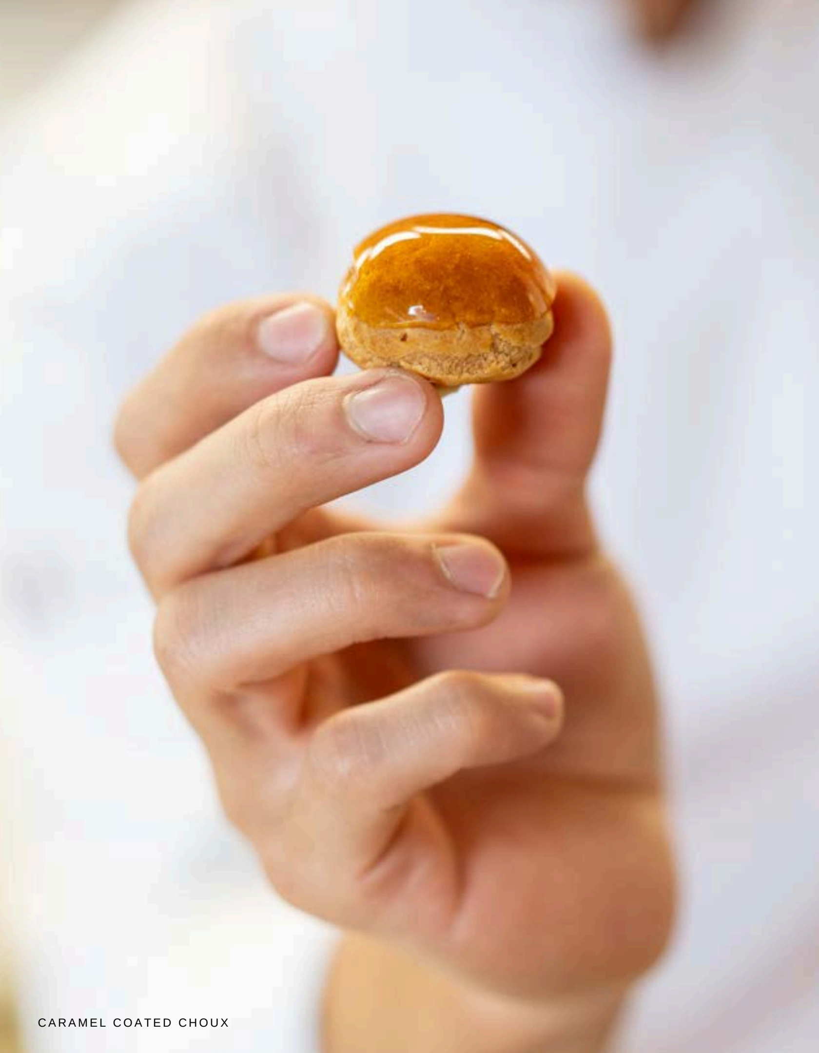
CARAMEL COATED CHOUX