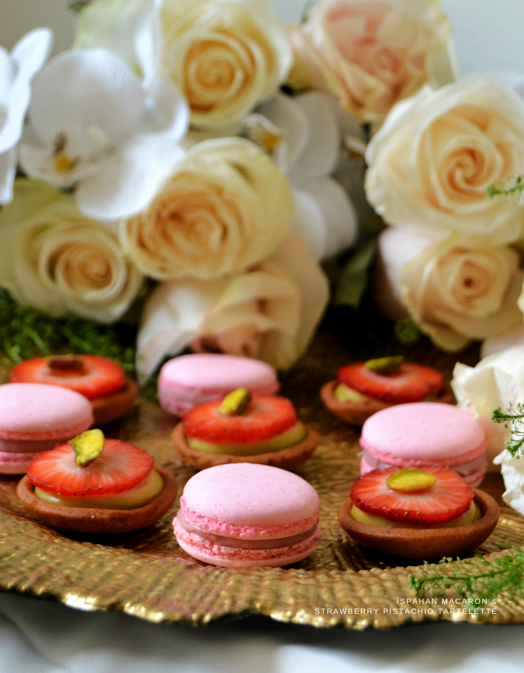
ISPAHAN MACARON & STRAWBERRY PISTACHIO TARTELETTE