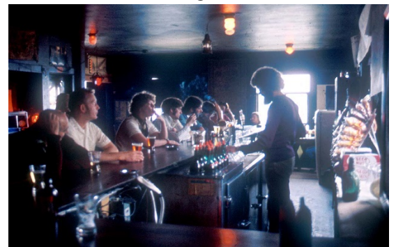
Inside Place Pigalle Tavern, circa 1975