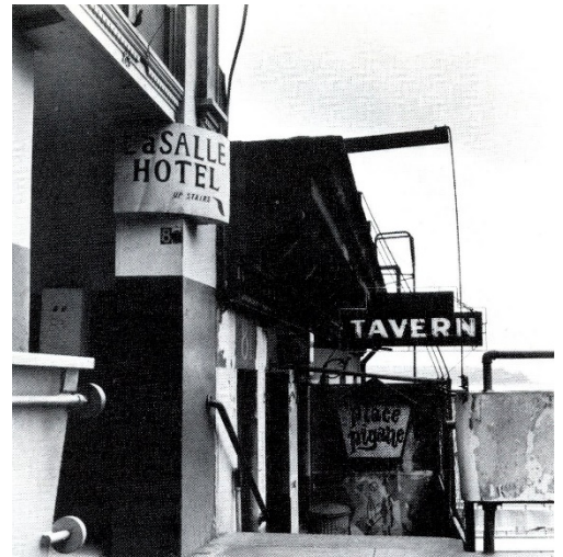
LaSalle Hotel entrance, early years

When the internment of Japanese Americans during World War II emptied 80% of the stalls at the Market, the Outlook Hotel (formerly the Cliff House Hotel) also became available. The infamous Nellie Curtis purchased it, extensively remodeled the building, and renamed it the LaSalle Hotel . Under the red glow of the Market's neon sign, Nellie transformed it into her flagship and the largest brothel in town. Conveniently located next door to the hotel lobby, the Lotus Inn remained busy.