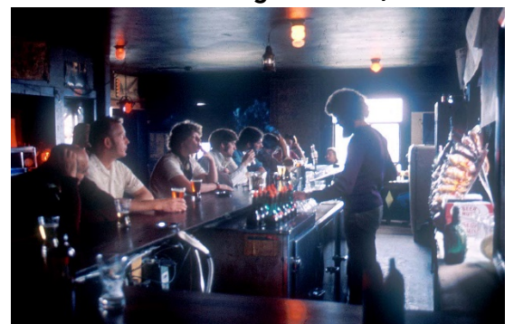
Inside Place Pigalle Tavern, circa 1975