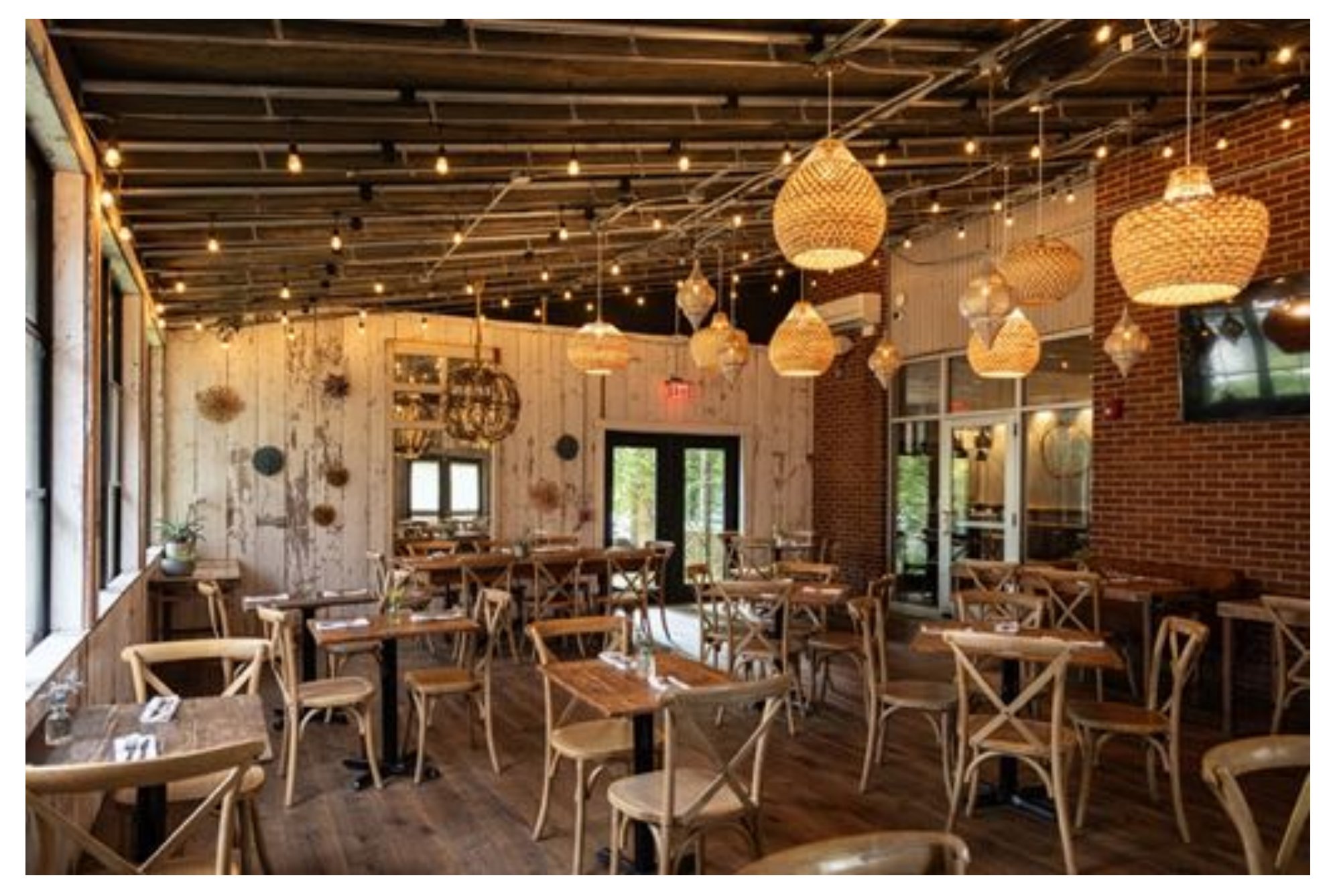
Our beautiful Side Terrace requires a minimum of 35 and comfortably holds a maximum of 55 seated guests. For a "standing-room-only" event, the Terrace can accommodate up to 70. This space has an indescribable ethereal feel to it with its warm, glowy lighting. The perfect venue for all of your dining needs and desires.