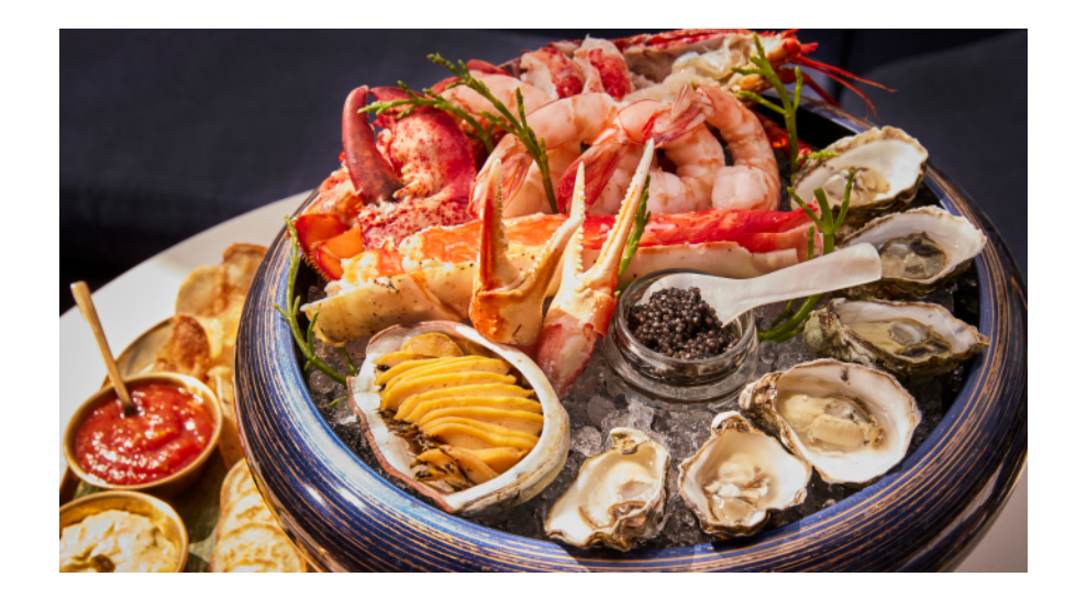
These specialty packages are available exclusively with a full buy-out of Mother of Pearl, and are designed for groups of up to 20 guests due to space limitations. Packages typically require up to 2 weeks of lead time for internal ordering and preparation. We recommend booking in advance to ensure availability and a seamless planning experience.