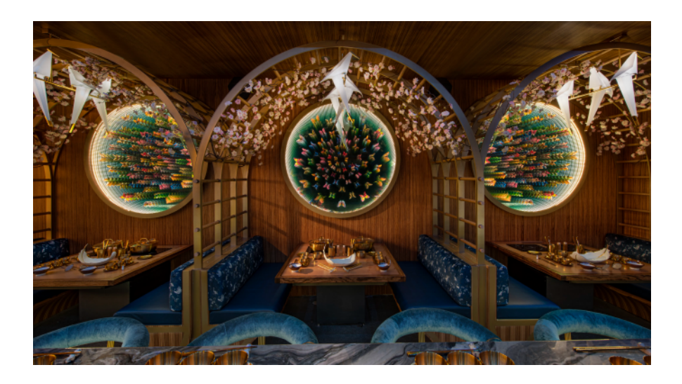
These specialty packages are designed for groups of 10 to 45 guests and typically require up to 2 weeks of lead time for internal ordering and preparation. We kindly recommend booking in advance to ensure availability and a seamless planning experience.