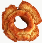
PLAIN OLD FASHIONED