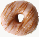
BROWN BUTTER GLAZED W/ SALTED CARAMEL DRIZZLE

Individual: $3.30 | 1/2 Dozen: $18.50 | Dozen: $32.25