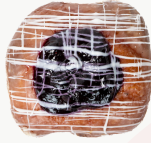
BLUEBERRY CREAM CHEESE POCKET