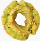
LEMON PISTACHIO OLD FASHIONED