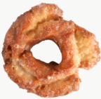
VANILLA GLAZED OLD FASHIONED

Individual: $3.30 | 1/2 Dozen: $18.50 | Dozen: $32.25