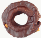
CHOCOLATE OLD FASHIONED