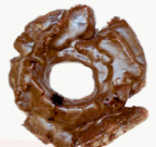
DOUBLE CHOCOLATE OLD FASHIONED