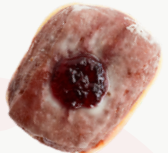
PEANUT BUTTER AND JELLY POCKET