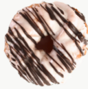
VANILLA GLAZED CRUELLER