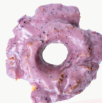
BLUEBERRY OLD FASHIONED