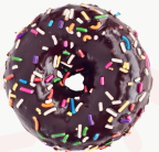
CHOCOLATE SPRINKLED CAKE