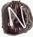
CHOCOLATE POCKET WITH NUTELLA®