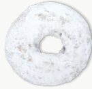
POWDERED SUGAR CAKE