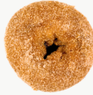
CINNAMON SUGAR CAKE