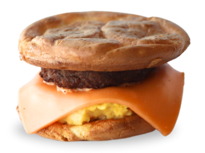
*Not the actual size. Photo is used for visual purposes only*

EGGS, ROLL (EGG WHITES (EGG WHITES, GUAR GUM, TRIETHYL CITRATE), EGG YOLK, CREAM CHEESE (PASTEURIZED MILK AND CREAM, CHEESE CULTURE, SALT, GUAR GUM, CAROB BEAN GUM. XANTHAN GUM). BAKING POWDER (SODIUM ACID PYROPHOSPHATE. SODIUM BICARBONATE, CORNSTARCH, AND MONOCALCIUM PHOSPHATE), BAKING SODA), PLANT SAUSAGE (WATER, WHEAT GLUTEN, SOY FLOUR, EGG WHITES, CORN OIL, SOY PROTEIN CONCENTRATE, SODIUM CASEINATE, MODIFIED TAPIOCA STARCH, CONTAINS 2% OR LESS OF THE FOLLOWING: SOYBEAN OIL, SOY PROTEIN ISOLATE, LACTOSE, AUTOLYZED YEAST EXTRACT. SPICES. METHYLCELLULOSE. NATURAL AND ARTIFICIAL FLAVORS. SODIUM TRIPOLYPHOSPHATE, SALT, HYDROLYZED WHEAT PROTEIN, ISODIUM INOSINATE, CARAMEL COLOR. WHEY, HYDROLYZED SOY PROTEIN, HYDROLYZED CORN GLUTEN, POTASSIUM CHLORIDE, DISODIUM GUANYLATE, DIPOTASSIUM PHOSPHATE, ONION POWDER, TETRASODIUM PYROPHOSPHATE. SODIUM HEXAMETAPHOSPHATE. SUCCINIC ACID. DRIED YEAST, MONOSODIUM PHOSPHATE, LACTIC ACID, VITAMINS AND MINERALS (NIACINAMIDE, IRON (FERROUS SULFATE), VITAMIN B1 (THIAMIN MONONITRATE), VITAMIN B6 (PYRIDOXINE HYDROCHLORIDE), VITAMIN B2 (RIBOFLAVIN), VITAMIN B12)), AMERICAN CHEESE (CULTURED MILK AND SKIM MILK, CREAM, NATURAL FLAVOR, SODIUM CITRATE, SALT, ANNATTO AND PAPRIKA (COLOR), ENZYMES, SORBIC ACID (PRESERVATIVE), SOY LECITHIN (ANTI-STICKING AGENT)), HEAVY CREAM (MILK, CONTAINS 2% OR LESS OF: CARRAGEENAN, MONO AND DIGLYCERIDES, POLYSORBATE 80), CLARIFIED BUTTER (PASTEURIZED CREAM), SALT