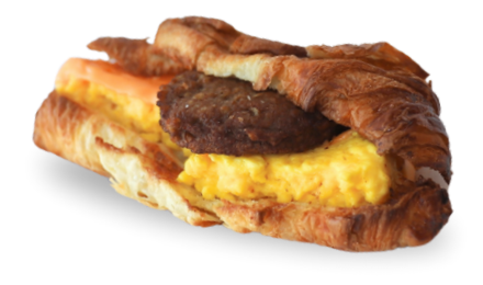
*Not the actual size. Photo is used for visual purposes only*

CROISSANT (UNBLEACHED ENRICHED FLOUR (WHEAT FLOUR, MALTED BARLEY FLOUR, NIACIN, IRON, THIAMIN MONONITRATE, RIBOFLAVIN, FOLIC ACID), BUTTER (CREAM), WATER. SUGAR. YEAST. EGGS. CONTAINS 2% OR LESS OF THE FOLLOWING: DRY WHOLE MILK. SALT. MILK (MILK. VIT. D3) WHEAT GLUTEN, XANTHAN GUM. ASCORBIC ACID. FOOD ENZYMES (ALPHA- MYLASE, XYLANASE)), EGGS, PLANT SAUSAGE (WATER, WHEAT GLUTEN, SOY FLOUR. EGG WHITES. CORN OIL. SOY PROTEIN CONCENTRATE. SODIUM CASEINATE. MODIFIED TAPIOCA STARCH, CONTAINS 2% OR LESS OF THE FOLLOWING: SOYBEAN OIL, SOY PROTEIN ISOLATE. LACTOSE. AUTOLYZED YEAST EXTRACT. SPICES. METHYLCELLULOSE, NATURAL AND ARTIFICIAL FLAVORS, SODIUM TRIPOLYPHOSPHATE, SALT. HYDROLYZED WHEAT PROTEIN. ISODIUM INOSINATE. CARAMEL COLOR. WHEY. HYDROLYZED SOY PROTEIN, HYDROLYZED CORN GLUTEN, POTASSIUM CHLORIDE, DISODIUM GUANYLATE, DIPOTASSIUM PHOSPHATE, ONION POWDER, TETRASODIUM PYROPHOSPHATE. SODIUM HEXAMETAPHOSPHATE. SUCCINIC ACID. DRIED YEAST. MONOSODIUM PHOSPHATE, LACTIC ACID, VITAMINS AND MINERALS (NIACINAMIDE, IRON (FERROUS SULFATE), VITAMIN B1 (THIAMIN MONONITRATE), VITAMIN B6 (PYRIDOXINE HYDROCHLORIDE), VITAMIN B2 (RIBOFLAVIN), VITAMIN B12)), AMERICAN CHEESE (CULTURED MILK AND SKIM MILK, CREAM, NATURAL FLAVOR, SODIUM CITRATE, SALT, ANNATTO AND PAPRIKA (COLOR), ENZYMES, SORBIC ACID (PRESERVATIVE), SOY LECITHIN (ANTI-STICKING AGENT)), HEAVY CREAM (MILK, CONTAINS 2% OR LESS OF: CARRAGEENAN, MONO AND DIGLYCERIDES, POLYSORBATE 80), CLARIFIED BUTTER (PASTEURIZED CREAM), SALT