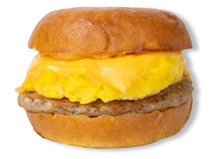
*Not the actual size. Photo is used for visual purposes only*