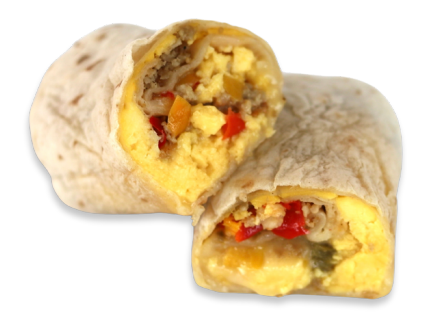
*Not the actual size. Photo is used for visual purposes only*