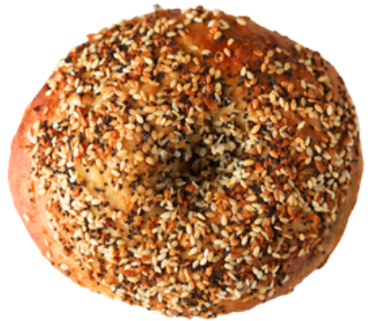
*Not the actual size. Photo is used for visual purposes only*

Our facilities produce products with tree nuts, soy, milk, eggs, and wheat. We cannot guarantee that any other products are safe to consume for people with any of these allergies.