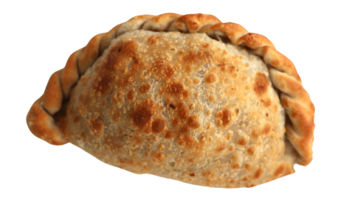
*Not the actual size. Photo is used for visual purposes only*