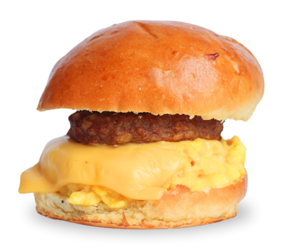
*Not the actual size. Photo is used for visual purposes only*