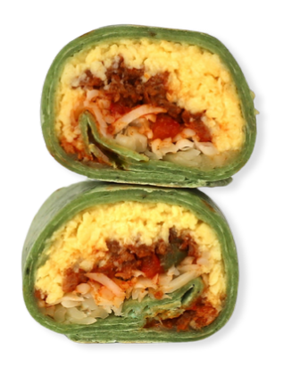
*Not the actual size. Photo is used for visual purposes only*