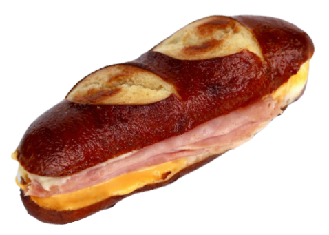
*Not the actual size. Photo is used for visual purposes only*