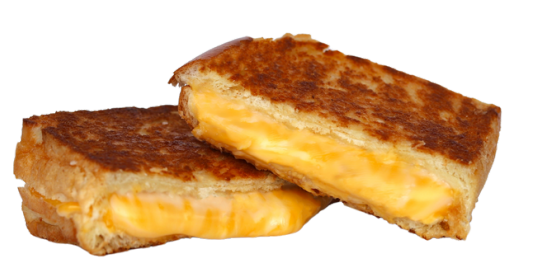
*Not the actual size. Photo is used for visual purposes only*