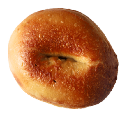
*Not the actual size. Photo is used for visual purposes only*

Our facilities produce products with tree nuts, soy, milk, eggs, and wheat. We cannot guarantee that any other products are safe to consume for people with any of these allergies.