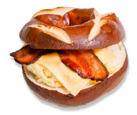
*Not the actual size. Photo is used for visual purposes only*