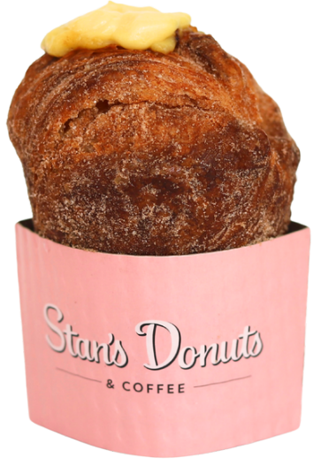
*Not the actual size. Photo is used for visual purposes only*