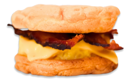
*Not the actual size. Photo is used for visual purposes only*