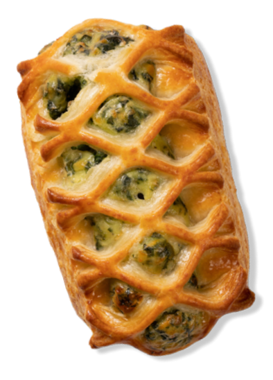
*Not the actual size. Photo is used for visual purposes only*