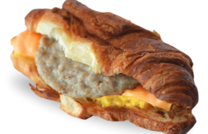
*Not the actual size. Photo is used for visual purposes only*