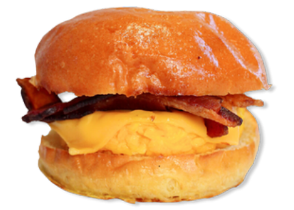
*Not the actual size. Photo is used for visual purposes only*