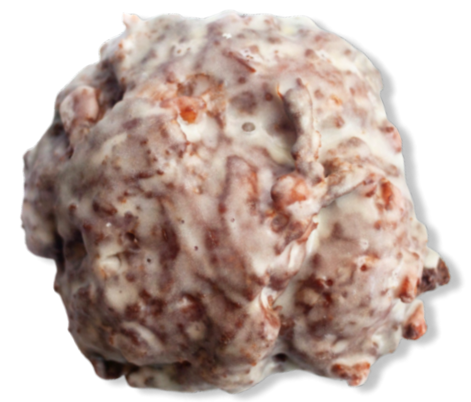
*Not the actual size. Photo is used for visual purposes only*

Fritters are made by using chopped yeast dough, cinnamon sugar, chopped apples and topped with a thin vanilla glaze.