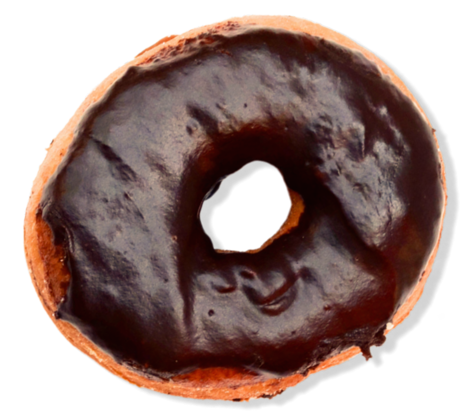
*Not the actual size. Photo is used for visual purposes only*

Enriched Wheat Flour (Wheat Flour, Malted Barley Flour, Niacin, Iron, Thiamin Mononitrate, Riboflavin, Folic Acid), Fudge Icing (Fondant (Cane Sugar, Glucose Syrup, Water), Palm Shortening (Palm Oil, Mono & Diglycerides, Polysorbate 60), Cocoa, Glucose Syrup, Palm Oil, Canola Oil, Water, Cocoa (Processed With Alkali), Invert Syrup, Sunflower Lecithin, Caramel Color (Contains Sulfites), Natural Vanilla Flavor (Water, Glycerin, Vanilla Extract, Natural Flavor, And Cane Sugar), Calcium Propionate, Sodium Benzoate, Natural Butter Flavor (Water, Propylene Glycol, Natural Flavors, Xanthan Gum, Sodium Benzoate, And Citric Acid), Salt), Water, Shortening (Soybean Oil, Hydrogenated Soybean Oil (High Oleic Soybean Oil, Soybean Oil)), Donut Mix (Dextrose, Palm Shortening (Palm Oil, Mono & Diglycerides, Polysorbate 60), Soy Flour, Salt, Wheat Flour, Baking Powder (Sodium Acid Pyrophosphate, Sodium Bicarbonate, Corn Starch and Monocalcium Phosphate), Wheat Flour, Diacetyl Tartaric Acid Esters of Mono & Diglycerides, Dextrose, Soybean Oil, Contains 2% or Less of the Following: Azodicarbonamide (ADA), Enzymes, Ascorbic Acid, L-Cysteine, Potato Starch, Dried Beta Carotene (Gum Arabic, Medium Chain Triglycerides, Palm Oil, Dextrin, Sugar, Ascorbic Acid, Beta Carotene, Mixed Tocopherols)) Contains 2% Or Less Of The Following: Yeast, Mono & Diglycerides, Enzymes