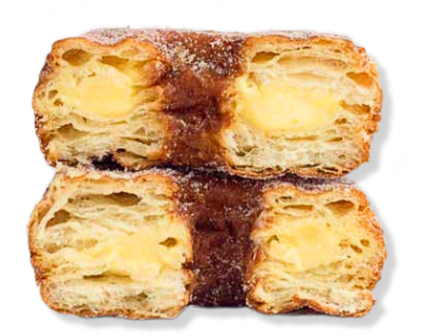
*Not the actual size. Photo is used for visual purposes only*

Our facilities produce products with tree nuts, soy, milk, eggs, and wheat. We cannot guarantee that any other products are safe to consume for people with any of these allergies.