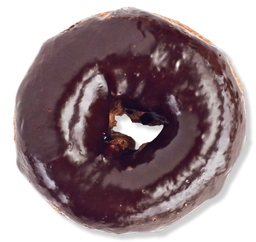
*Not the actual size. Photo is used for visual purposes only \!\!\!\!\!\!\!\!\!\!\!\!\!\!\!\!\!

Our facilities produce products with tree nuts, soy, milk, eggs, and wheat. We cannot guarantee that any other products are safe to consume for people with any of these allergies.