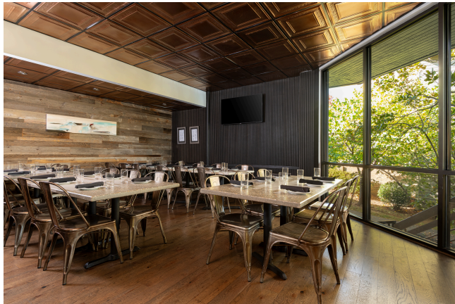
From 6 to 24 people