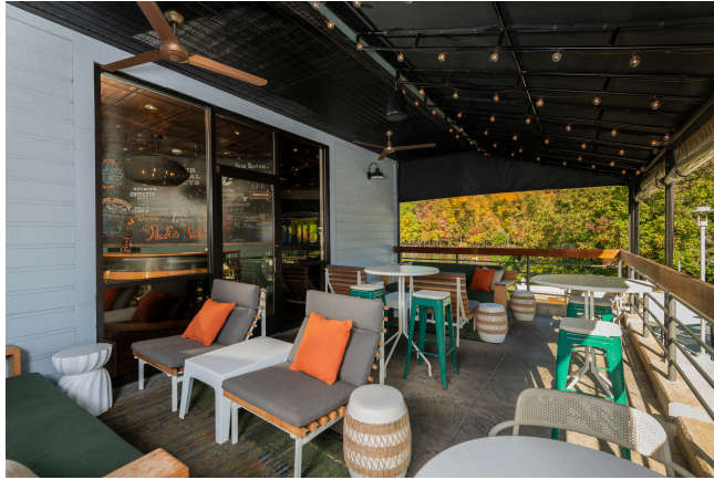
From 6 to 16 people