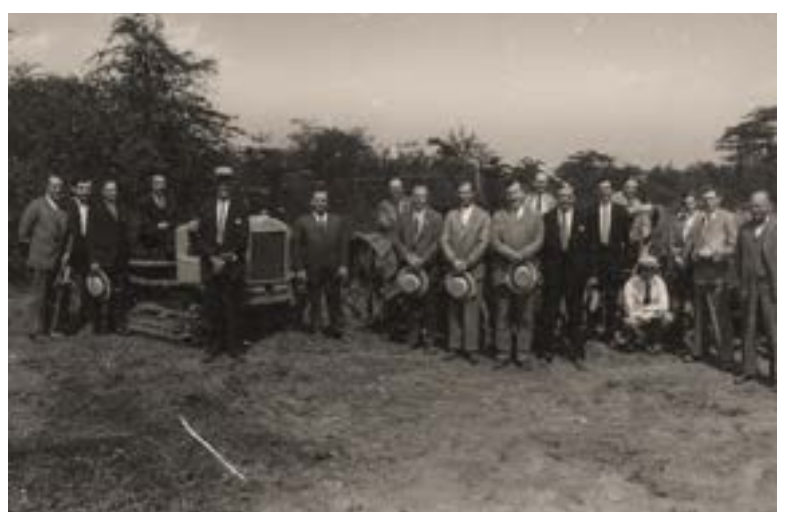
Building in progress