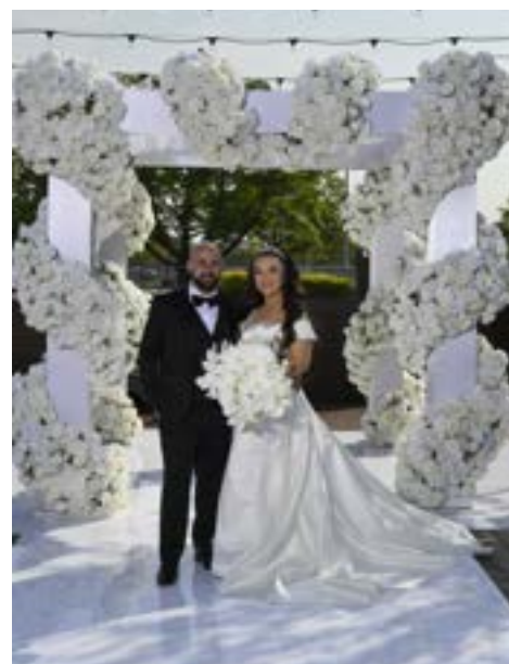
Ceremony On Our Garden Patio

Prepare for an extraordinary journey at The Vanderbilt, where we craft events of boundless extravagance tailored precisely to your desires. Picture this: an enchanting soirée for up to 420 guests feasting and dancing, or a mesmerizing cocktail affair hosting up to 550 revelers. Dive into a realm of utter relaxation as we handle every meticulous detail, allowing you to revel in the splendor of your occasion. Our venue boasts an array of captivating spaces, from the majestic ocean-facing Grand Ballroom to the intimate Palm Room, the serene Garden Patio, and the picturesque Beach Ceremonial Space—where your event's potential knows no bounds. With our dedicated team of professionals, expect nothing short of perfection from start to finish. Enjoy a plethora of complimentary amenities, including valet parking, coat check, attentive lounge attendants, a lavishly appointed bridal suite, impeccable white glove service, comprehensive audio/visual equipment, and wheelchair accessibility—all seamlessly woven into the fabric of your unforgettable experience.