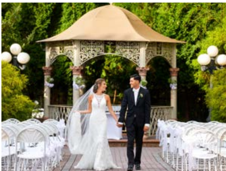
Happily Ever After Down The Aisle