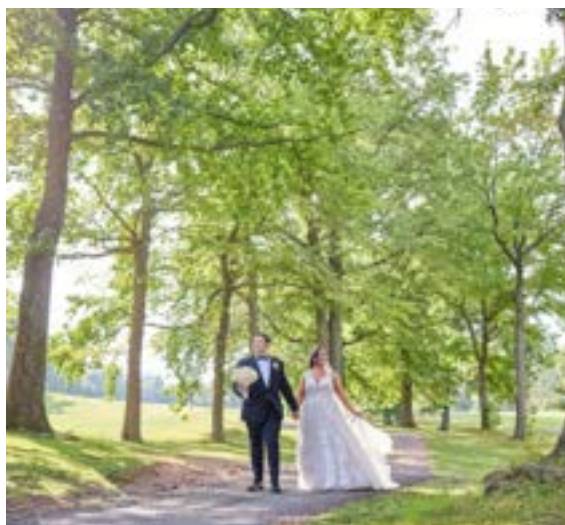
An Elegant Stroll