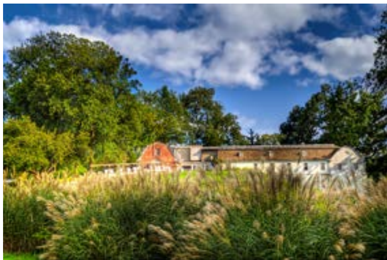
Rustic Elegance From The First Moment