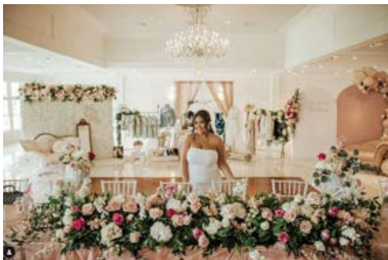
A Bridal Shower In Our Grand Ballroom