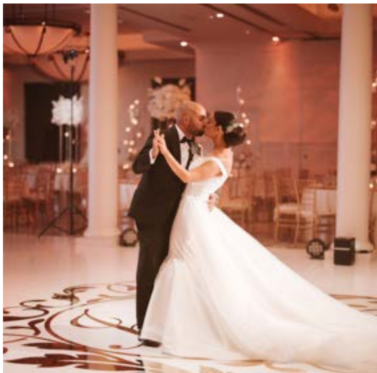
Tender Moments In Our Ballroom