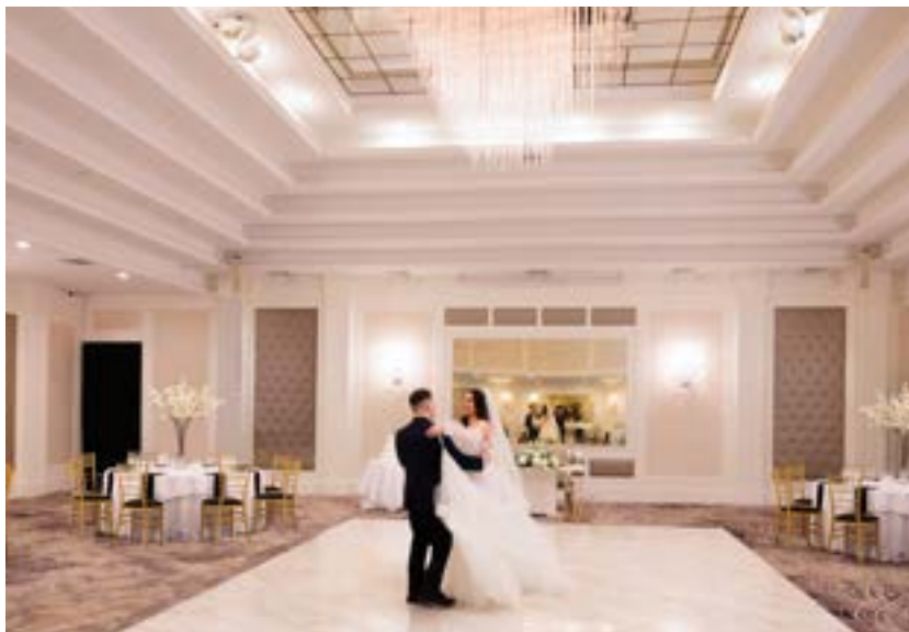
The Grand Ballroom With Our Custom Lighting