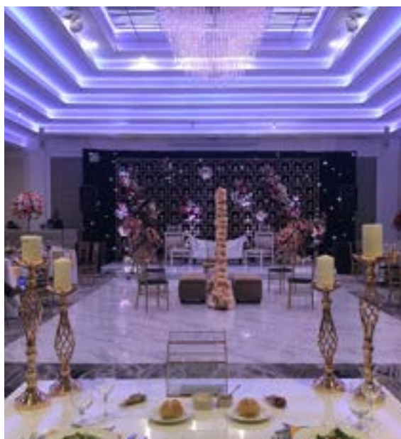
An Evening To Remember