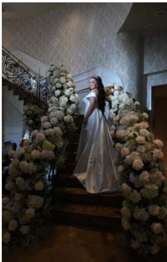
An Elegant Entrance