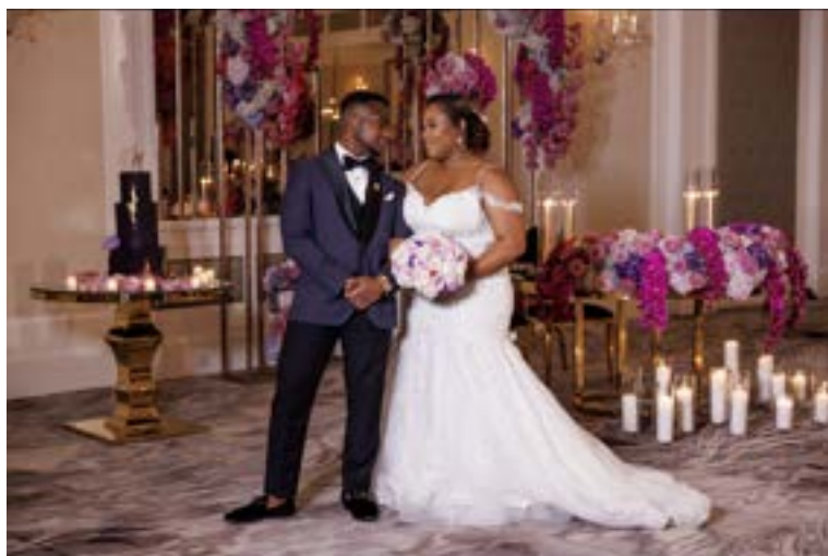
Bride & Groom Pose At The Sweetheart Table