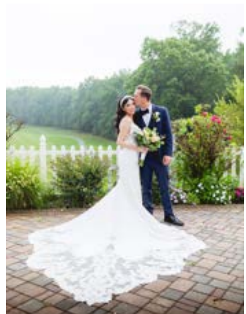
Bliss On Our Patio

Indulge in unparalleled luxury at The Grand Oaks Country Club, where excellence is not just a standard, but a way of life. Our exquisite venue, nestled in the heart of Staten Island overlooking the Golf Course, sets the stage for unforgettable events. With award-winning chefs crafting bespoke menus to tantalize even the most discerning palates, every detail is meticulously curated to enchant your senses. Whether you're planning an intimate gathering or a lavish reception, our full-service facility caters to your every need with an array of breakfast, lunch, dinner, and bar selections. From weddings to corporate events, our expert banquet staff ensures seamless execution, leaving you free to savor every moment. With our renowned chef tailoring menus to your personal taste and style, and our dedicated team exceeding expectations at every turn, your event at The Grand Oaks Country Club is destined to create timeless memories. And after a round of golf on our pristine 18-hole course, unwind with one of our exclusive Golf Outing Packages, because luxury knows no bounds here.