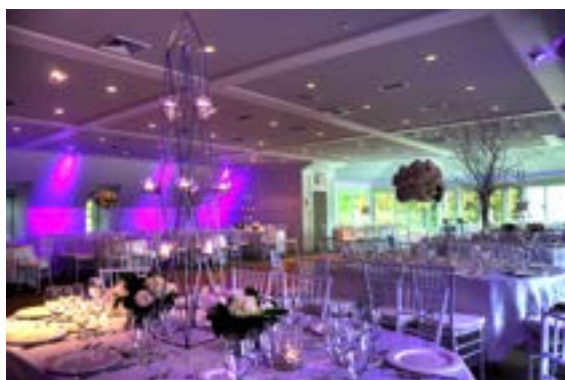
Event Set Up In The Overlook