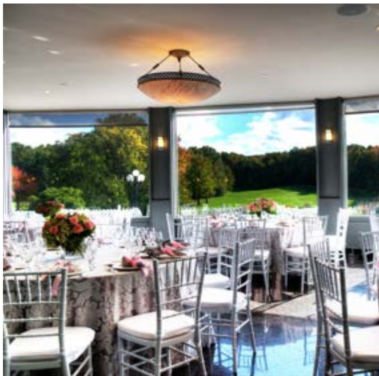
Setup In Our Fairway Ballroom