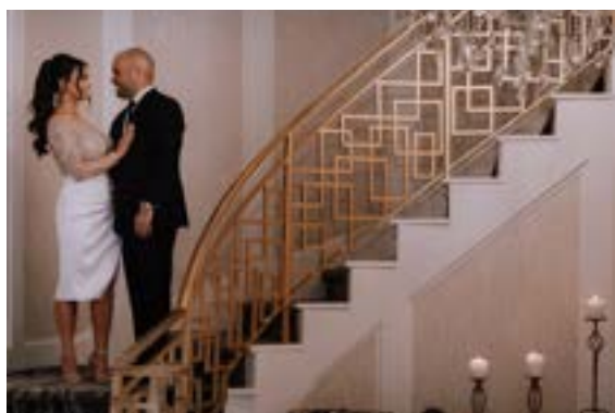
A Tender Embrace Before A Grand Entrance