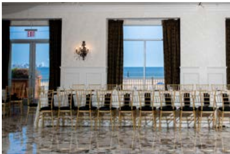
Ocean Views From Our Ballroom