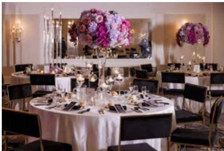
Set For Your Reception