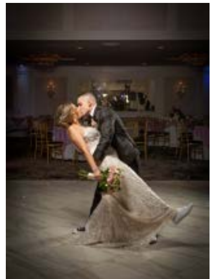
The Start Of Happily Ever After