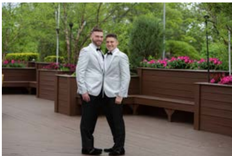
Our Palm Garden