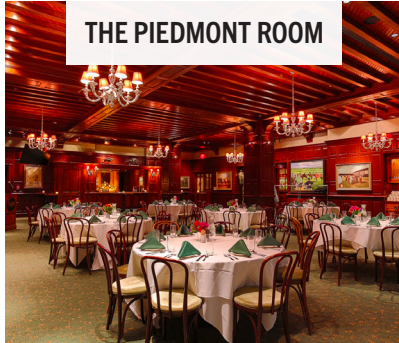
THE PIEDMONT ROOM