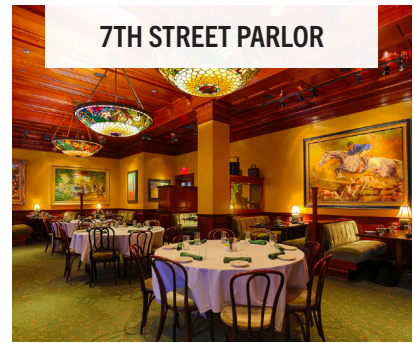
7TH STREET PARLOR