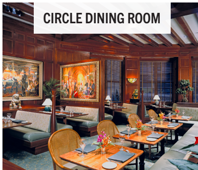
CIRCLE DINING ROOM