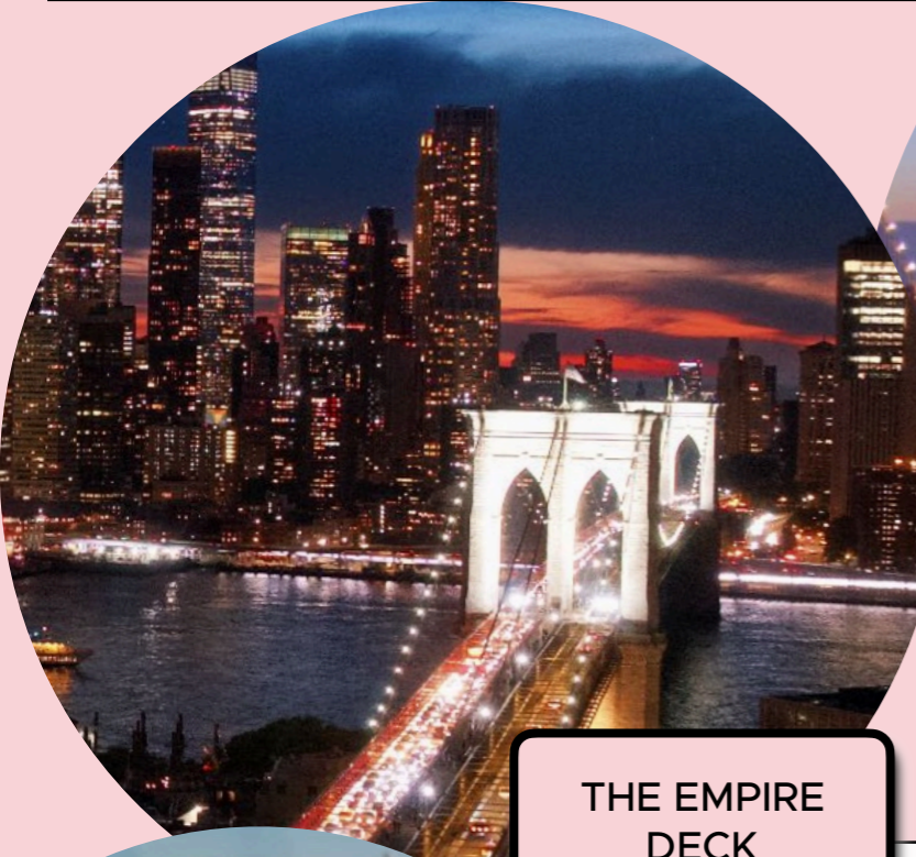
THE EMPIRE DECK