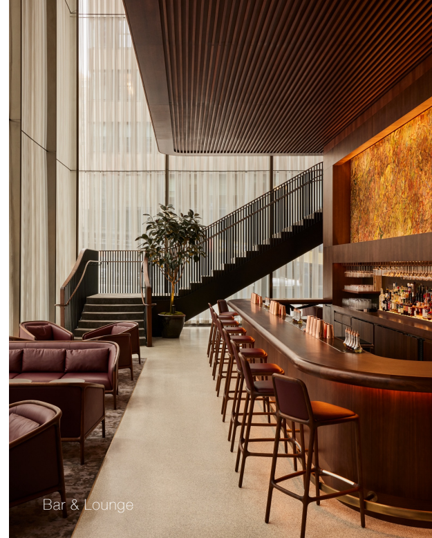
Bar & Lounge