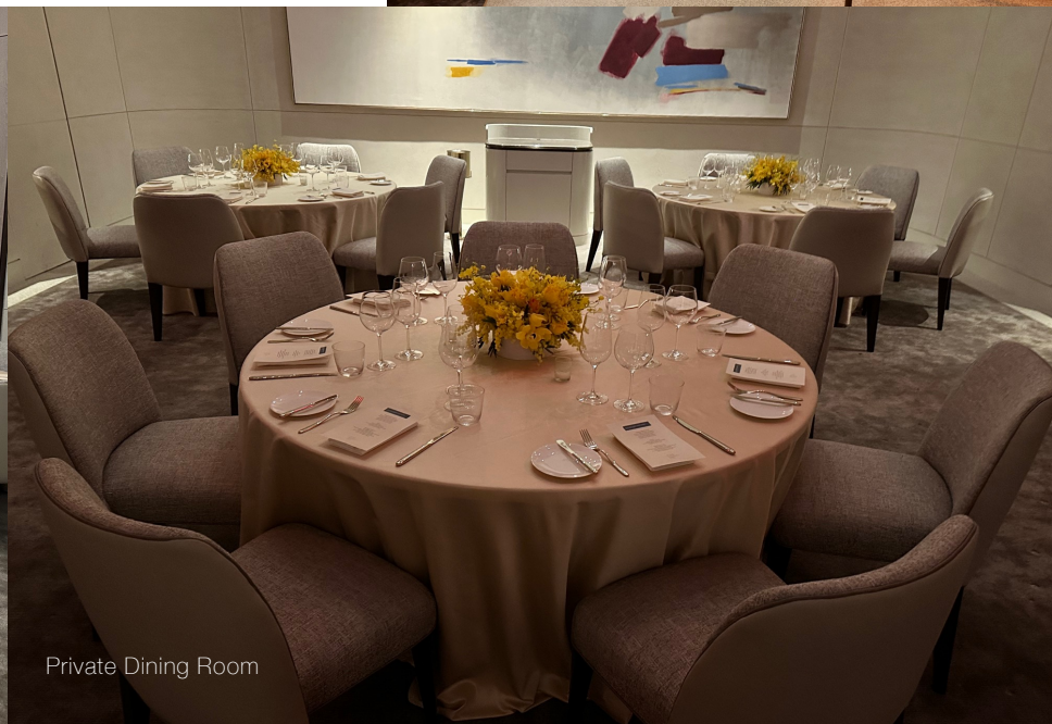
Private Dining Room