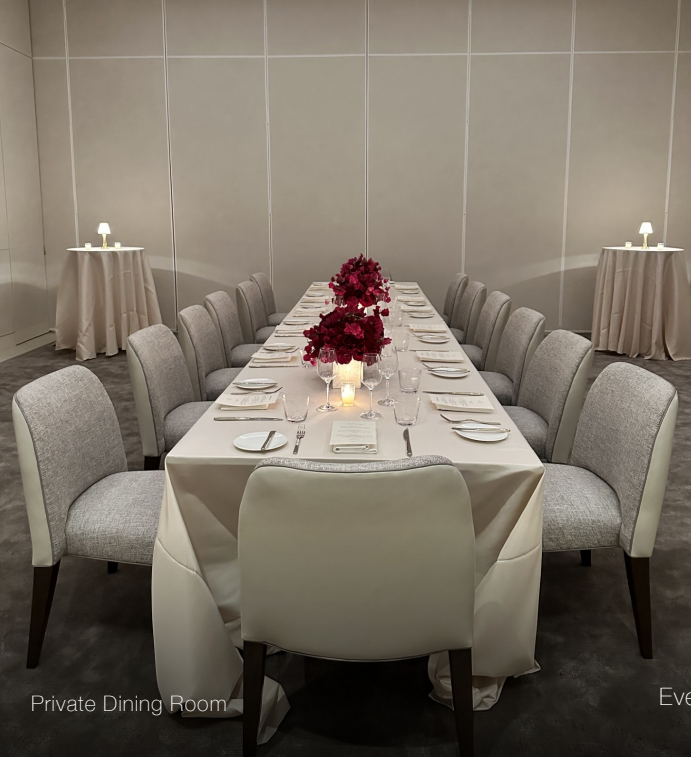
Private Dining Room