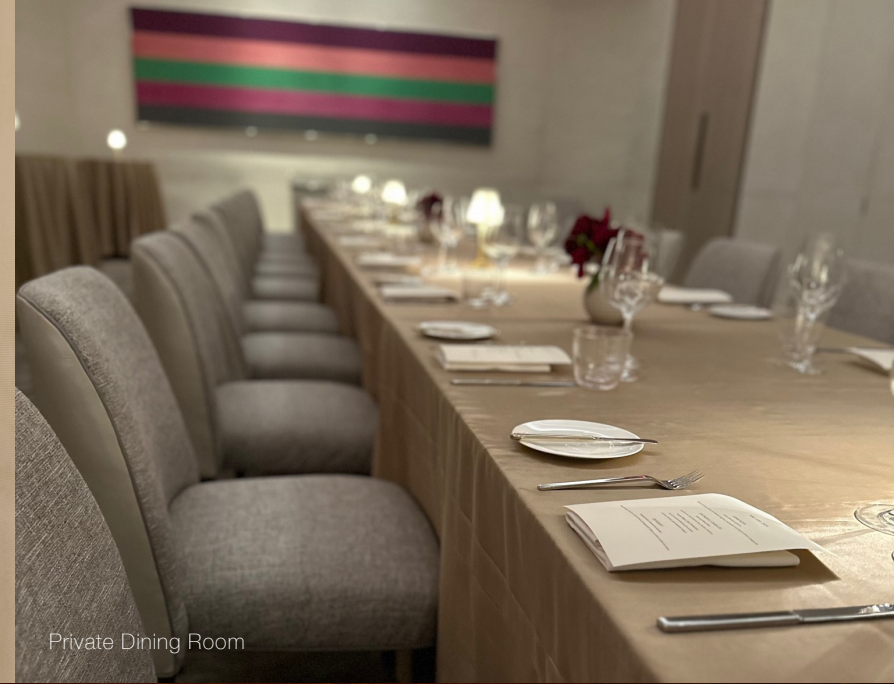
Private Dining Room