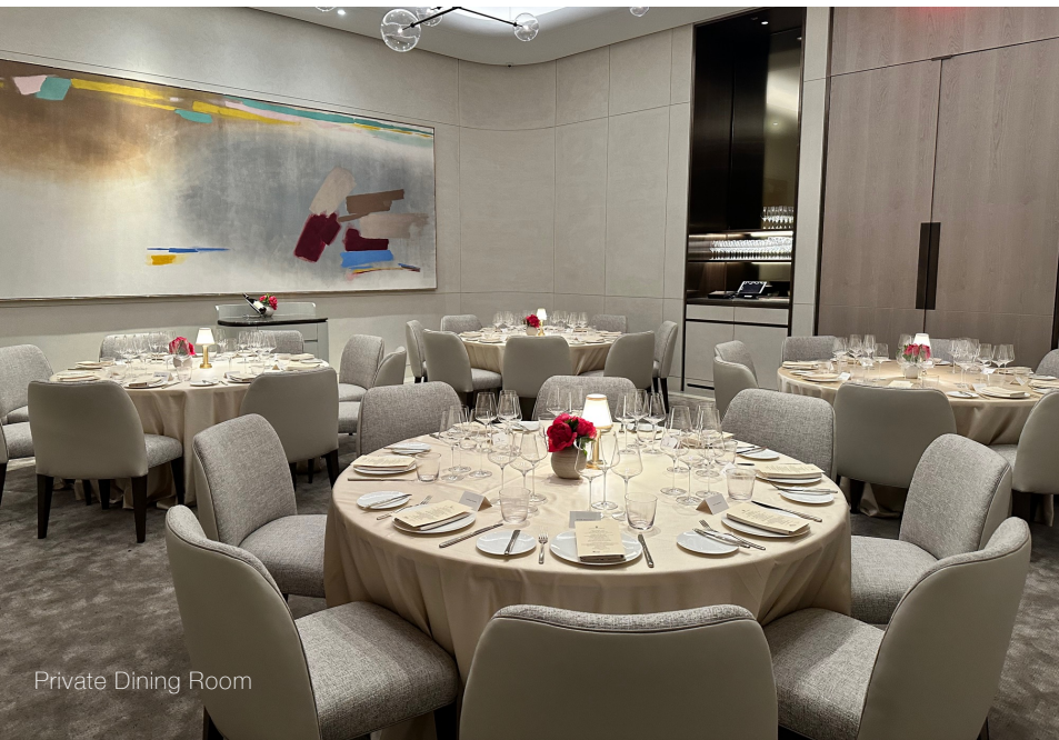
Private Dining Room