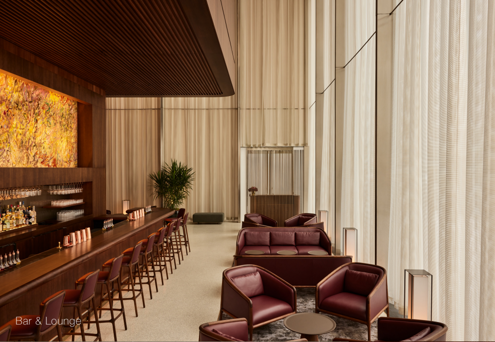
Bar & Lounge