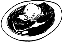
STICKY TOFFEE DATE CAKE malt gelato, toffee sauce 18