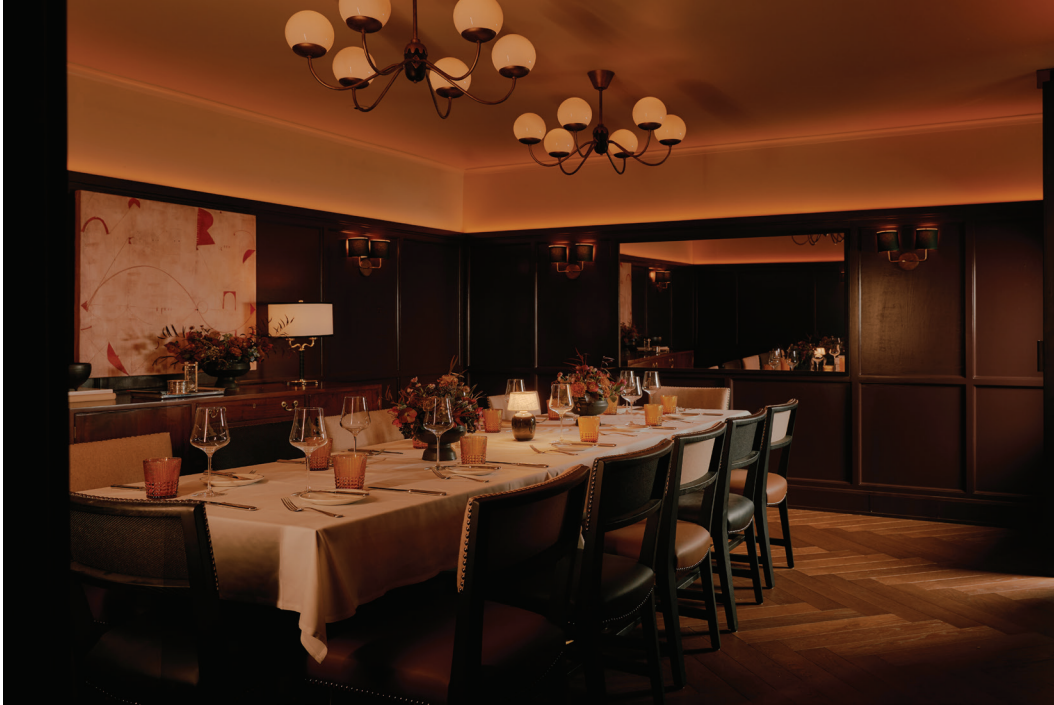
Second Floor - Mezzanine Level

Our signature private dining room on the Mezzanine level is perfect for intimate dining events and elevated meetings with a fully private space complete with A/V capabilities.