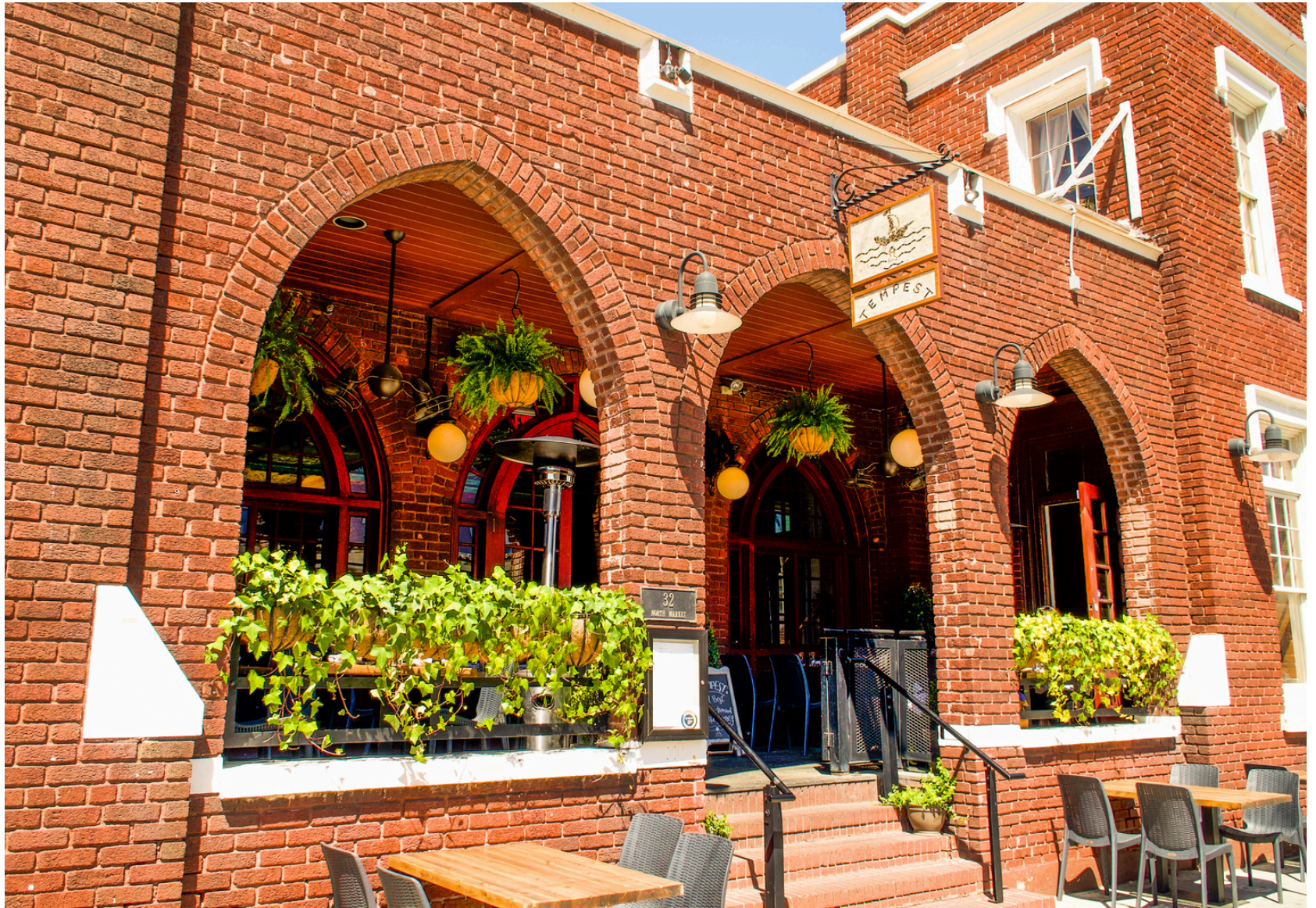
Tempest Private Dining