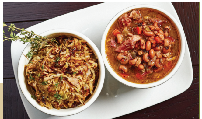
Sautéed Cabbage & Black-Eyed Peas

*Tax + 15% handling fee applied to food TO-GO purchases. NO GRATUITY NECESSARY.