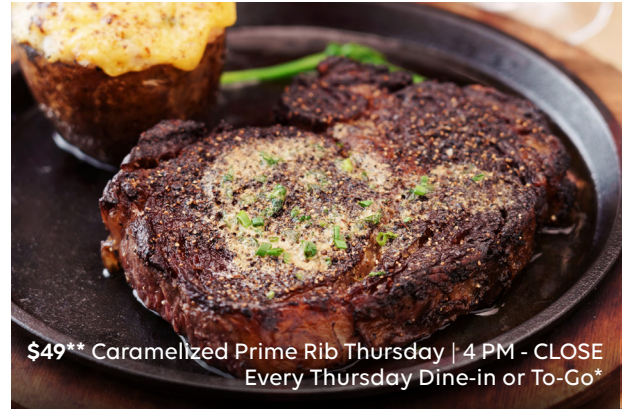
$49** Caramelized Prime Rib Thursday | 4 PM - CLOSE Every Thursday Dine-in or To-Go*