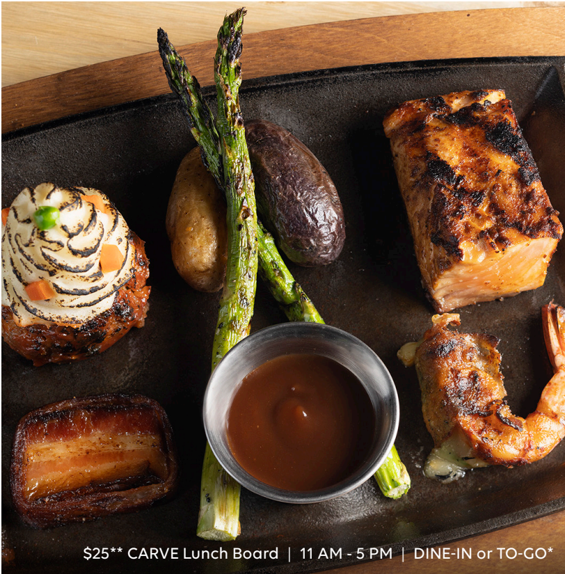
$25** CARVE Lunch Board | 11 AM - 5 PM | DINE-IN or TO-GO*