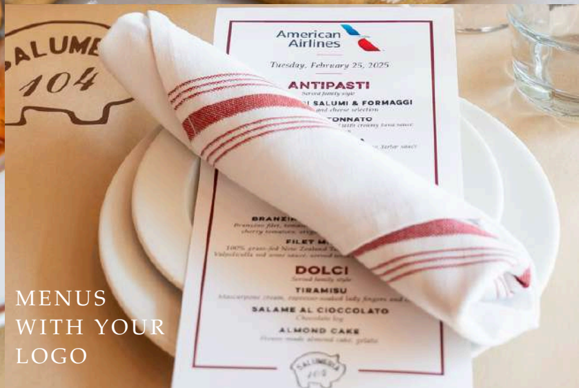
MENUS WITH YOUR LOGO