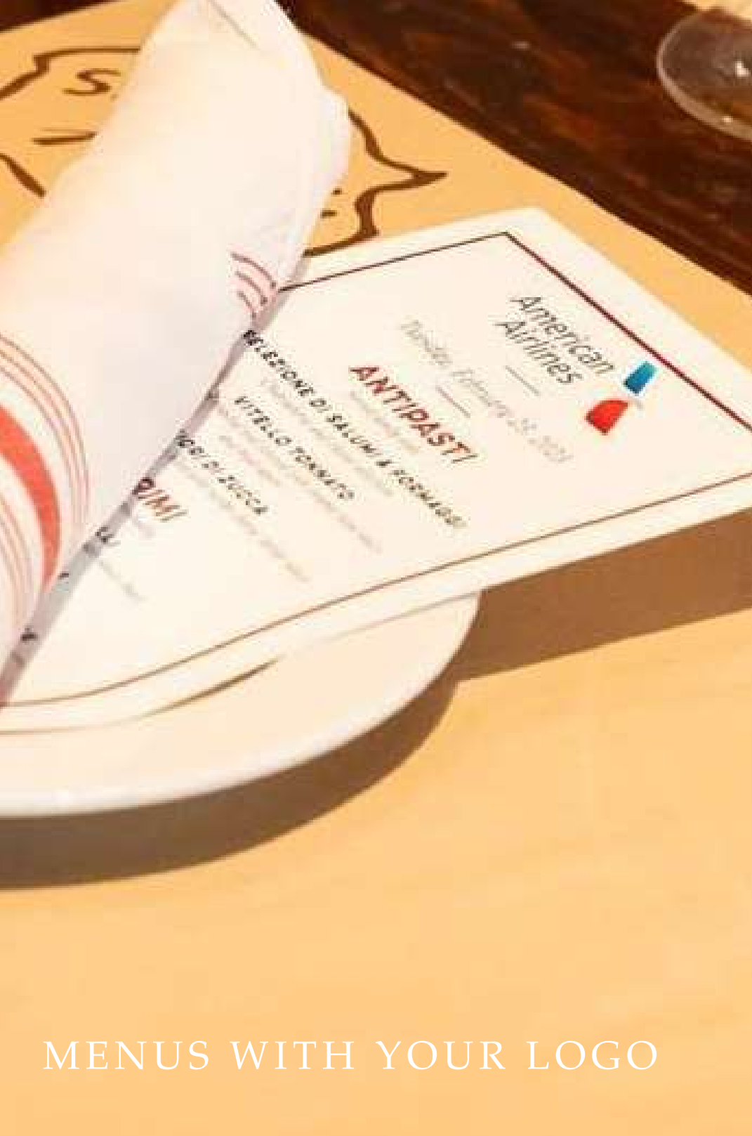
MENUS WITH YOUR LOGO