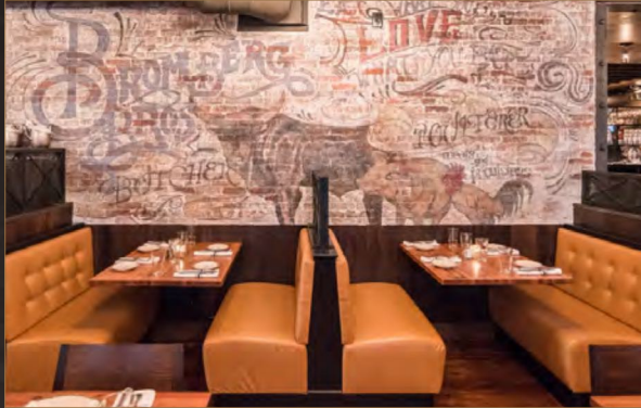
West Dining Room Seated: 65