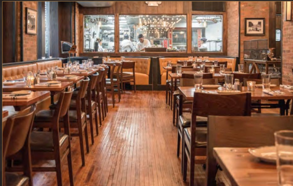
East Dining Room Seated: 50