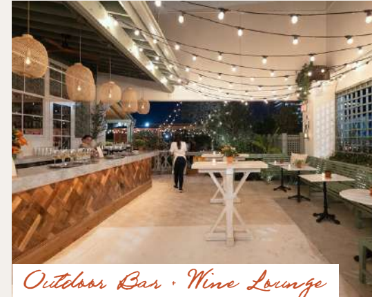
Outdoor Bar + Wine Lounge