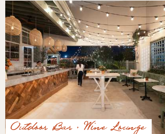
Outdoor Bar & Wine Lounge