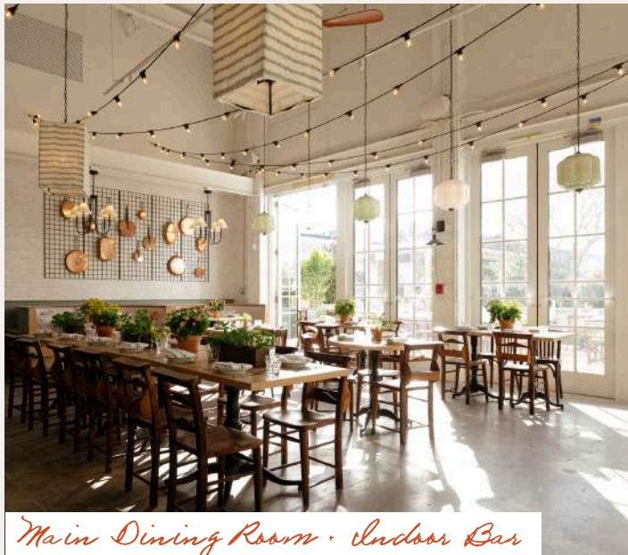
Main Dining Room & Indoor Bar