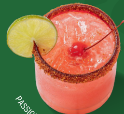
PASSION FRUIT MARGARITA