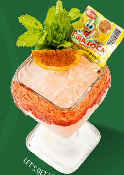
LET'S GET LIT