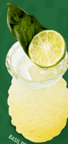
BASIL PINEAPPLE BREEZE